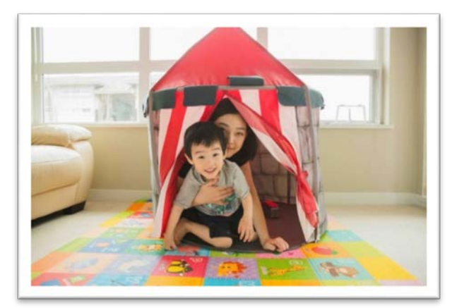
Support kids to be all that they can be

When you give directly to United Way of the Lower Mainland, you help give kids the boost they need to succeed in life. Whether it's making sure they are ready to succeed by the time they reach school, that they are fed so that they can focus on their studies instead of their grumbling tummies, or that they learn life skills and benefit from positive mentors, we help kids reach their full potential.